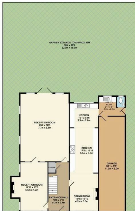
GROUND FLOOR APPROX. FLOOR AREA 1689 SQ.FT. (156.1 SQ.M.)